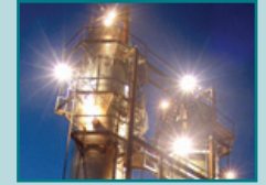
INDUSTRIAL SERVICES Number 1 Heat Exchanger Services

EMCOR Group, Inc. is a Fortune 500® company with 2010 estimated revenues of $5.1 billion, EMCOR Group (NYSE: EME) is a global leader in mechanical and electrical construction, energy infrastructure and facilities services. EMCOR represents a rare combination of international reach with local execution, combining the strength of an industry leader with over 24,000 highly skilled employees and 170+ locations.