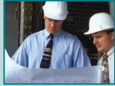
INTERNATIONAL CONSTRUCTION Market Leader