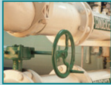
MECHANICAL CONSTRUCTION Number 1