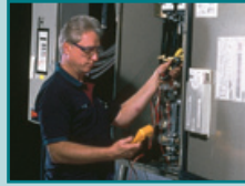
SITE-BASED FACILITIES SERVICES Market Leader