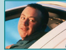
MECHANICAL SERVICES Number 1 Non-OEM