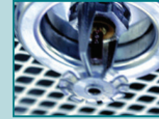
FIRE PROTECTION SERVICES Number 2 Non-OEM