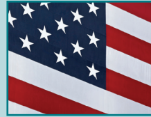
GOVERNMENT SERVICES Top 10 Position